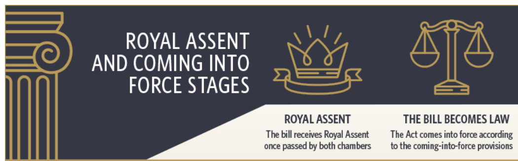
Figure 3 – Royal Assent and Coming-into-Force Stages