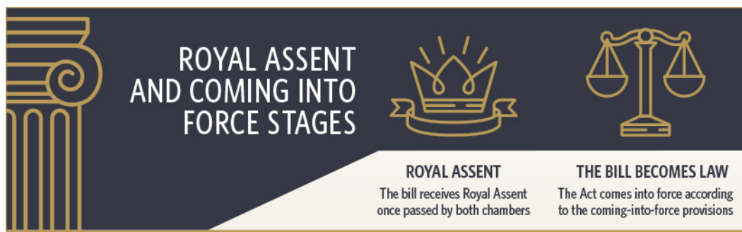
Figure 3 – Royal Assent and Coming-into-Force Stages